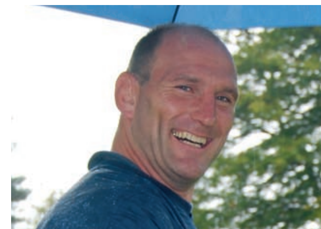
Lawrence Dallaglio | Friend of MAD

We look forward to welcoming back these special guests to our 2009 event.