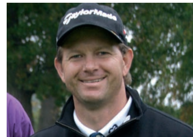
Retief Goosen | Honorary Patron to the MAD UK Golf Event

2009 season to date: His game was on the rise in 2009, with two wins on two major tours. Goosen won his second event in four worldwide starts on the Sunshine Tour at the Africa Open in January, where he came from behind to win by one stroke over four players and take the trophy. He then won his seventh PGA Tour title at the Transitions Championship in March 2009, beating Charles Howell III and Brett Quigley by one stroke. This win vaulted Goosen to number 22 in the Official World Golf Rankings, his highest position since November 2007.